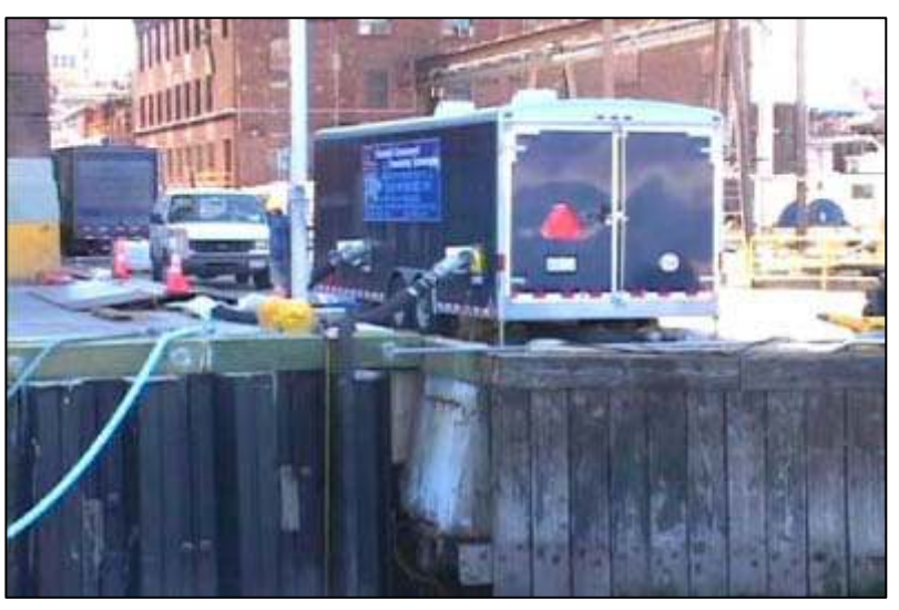
SmartFeed<sup>™</sup> is a patent-pending technology of Mineral Processing Services, LLC. Geotube© is a registered trademark of TenCate. Used with permission.

The patent-pending SmartFeed<sup>™</sup> system provided automated polymer mixing, injection and realtime performance data for the project.